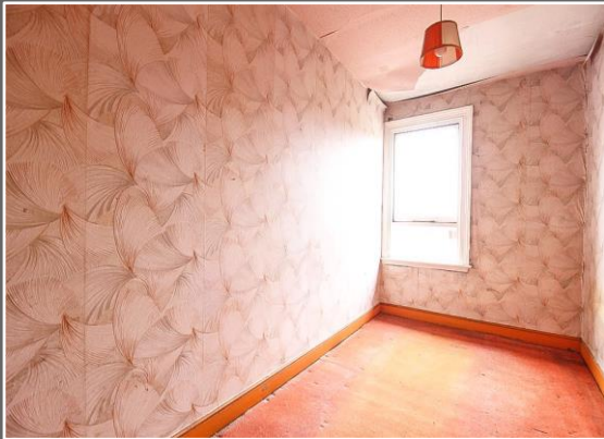
GROUND FLOOR 102 sq ft (9.4 sq m) approx.